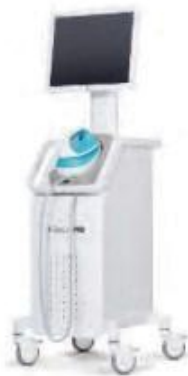
Figure 3 — DeepView Generation 3 System

We have developed proprietary AI algorithms and imaging technology to assist clinicians to make more accurate and efficient treatment decisions in managing a patient’s wounds. This technology is the result of 13 years of research and development, thousands of hours of user feedback, and most importantly, the continual commitment to ensuring that the output from DeepView answers a clinical question that is meaningful to physicians. We own and control the entirety of our data pipeline. We only rely on images and data that the DeepView System collects in a controlled clinical environment and do not rely on stock images or databases for our algorithms. All optical technology has been developed in-house and is specifically engineered to collect this imaging data. A current image of our cart-based DeepView System appears below in Figure 3.