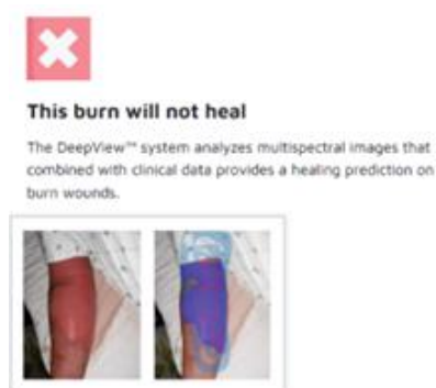
Figure 2 — Illustration of DeepView's binary decision assist output where the colored region marks the predicted non-healing portion of the wound.

The DeepView System is designed to assist clinicians in making accurate, timely, and informed decisions regarding the treatment of the patient's wound. DeepView provides physicians with an immediate assessment of a burn wound's healing potential with a binary outcome determination. We have conducted three large clinical studies with multiple sites across the United States, enrolling 413 patients, including 329 adult burn patients and 84 pediatric burn patients. Through these studies, we were able to determine burn assessment accuracy in both surgery and non-surgical treatment.